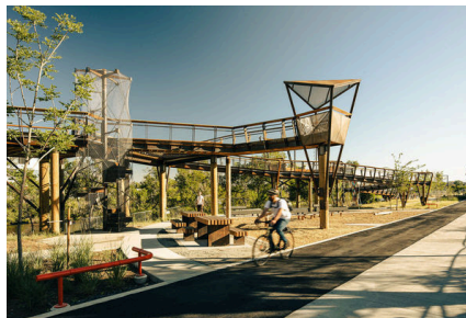
The Promenade at RiNo ArtPark

The promenade was designed by Tres Birds , the Denver-based architecture firm known for their sustainable approach. The steel-based walkway utilizes telephone poles as structural supports raising the promenade 28 feet at its highest point, where it extends 30 feet into an expansive deck. Creative experiences include a sturdy "spider web" net that can be used for lounging and porch-type swings. The wood plank decking, railings and picnic tables are crafted from sustainably-sourced lumber that will weather to grey. Recycled plastic milk bottles formed into grey blocks have been constructed into ground seating. Next to the promenade, Tres Birds has designed a children's playground constructed with recycled materials.